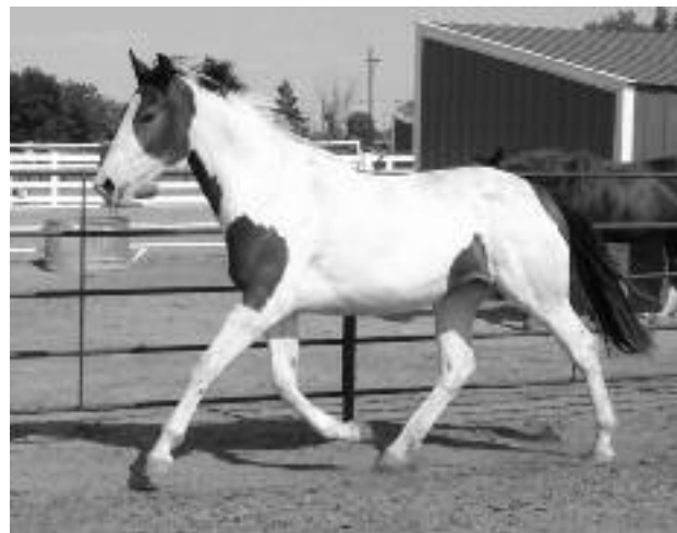
TICKLE ME - $17,000