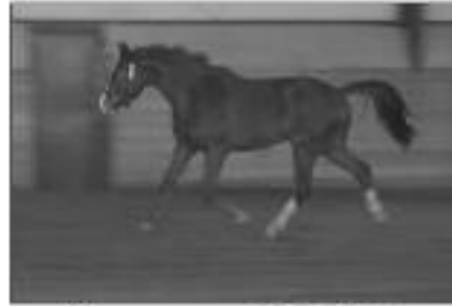
VISHNU - 25,000