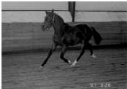
RHAPSODY - 14,000