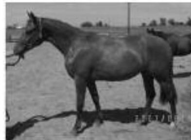
OXIANA - 15,000