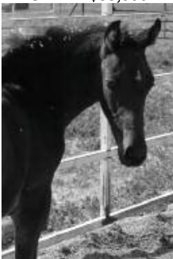
DON'T BE CRUEL - $8,000