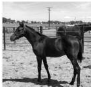
REFLEKTIION'S RIO - 10,000