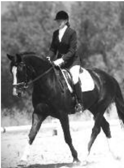
ONYX - $35,000