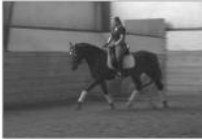
ROSE - 25,000