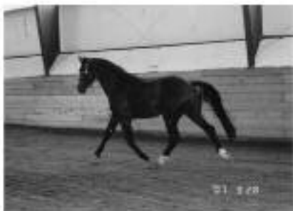
ZAR'S INSPIRATION - 15,000