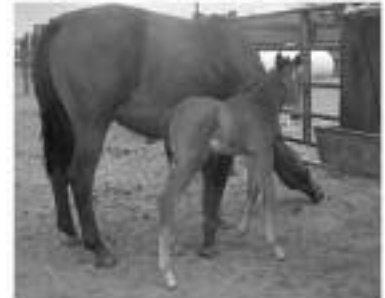
MINUET - 7,000