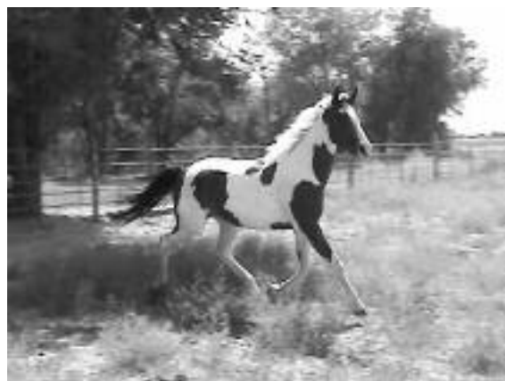
BLUE HAWAII - $12,000