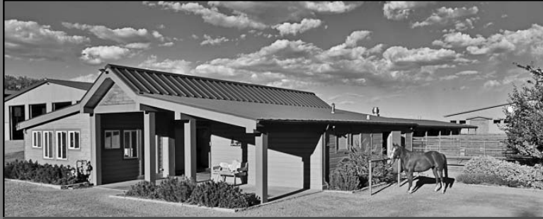
6303 Ute Hwy $13,950,000

235-acre equestrian property with four residences, a 36,400 sq ft indoor arena, state of the art horse barn, an equipment shop, hay barn, and multiple out buildings. Additional building sites.