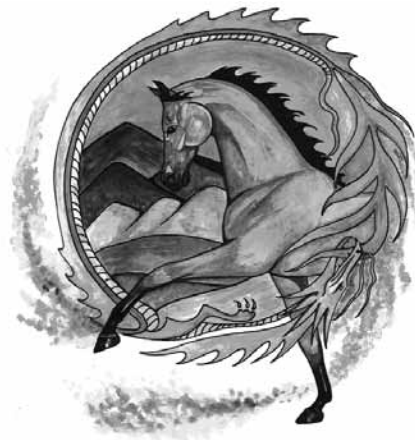
"The Year of the Horse"