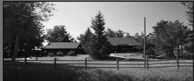
10496 Remuda Dr $559,000

4700 sq ft 4-bed, 4-bath custom home on 40 acres. Fenced pastures with horse set-up, heated utility building and separate guest quarters.