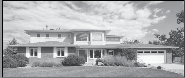
7333 N 63rd St $979,000

Energy-efficient, 4-bed home on 31 irrigated acres. Suitable for crop farm or livestock operation. Nearby trail riding and beautiful mountain views.