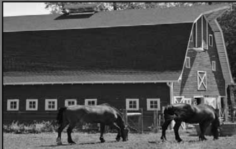
7873 Saint Vrain Rd $995,000

4-bed, 4-bath ranch home on 2.8 acres. 4-stall barn with an attached multi-purpose utility building. Property can be operated with three turnout areas.