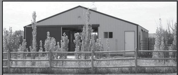
7875 N. 95th St $555,000

28-acre dream farm in private setting just minutes from Boulder. Charming contemporary farmhouse and outbuildings. Lush gardens, hayfields and 20 irrigated shares of Left Hand Ditch.