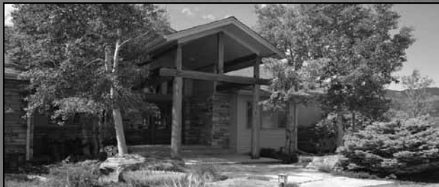
8957 N 39th St $1,500,000

Includes two parcels: a 70-acre equestrian operation and a 10-acre development parcel of residential sites. 36,000 sq ft indoor arena and a 7,000 sq ft breeding barn with 24 stalls.