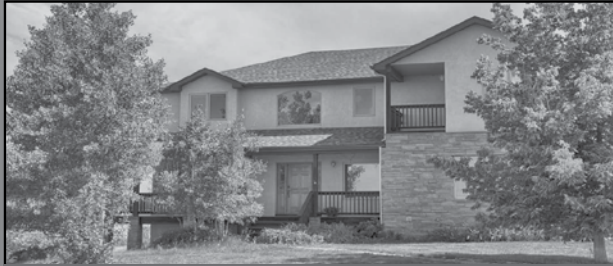
5977 Nelson Rd $995,000

Boulder's Independent Real Estate Broker