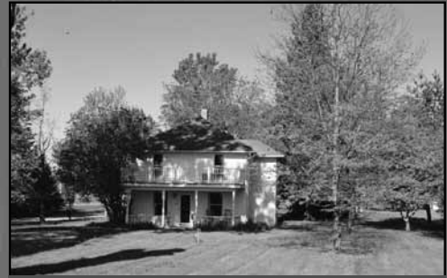
4937 N. 109th St $775,000

235-acre equestrian property with four residences, a 36,400 sq ft indoor arena, state of the art horse barn, an equipment shop, hay barn, and multiple out buildings. Additional building sites.