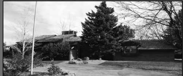
7903 Plateau Dr $658,000

17-acre horse property with 13-stall barn, small lunging arena, and a building site. Water rights include 2 shares of Ish Reservoir.