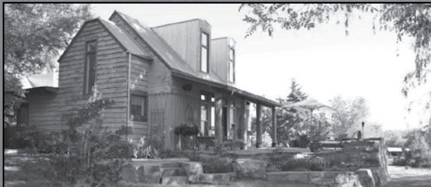
5740 Prospect Rd $1,650,000

5-acre horse property 10 minutes from Boulder. Contemporary home with multiple outbuildings. Includes a one-third share in a spring fed pond.