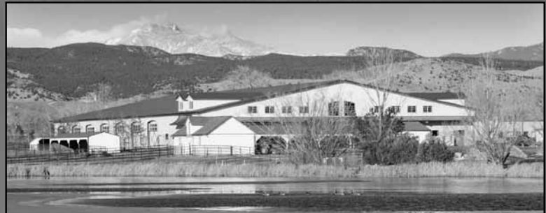
7171 Pike Rd $10,000,000

Charming 5-acre setting with home and apartment above garage. Horse-ready and suited for market gardening.