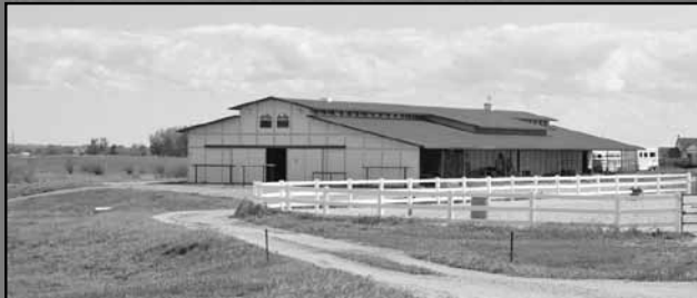
18490 County Rd 1 $500,000

3-acre horse property with a 3-bed, 2-bath farm house and separate guest cottage. Loafing shed and historic barn.