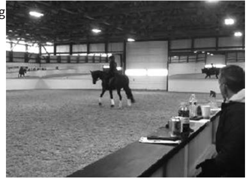
THREE MIRRORS - Believe & Judi combos from all angles!