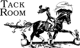
"Dressage In The Wind" by Oscar Woodruff

DID YOU KNOW WE HAVE a mobile unit for your saddle fitting needs, and will be at several area shows in WY and CO. Call for info, dates and location.