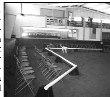
Clinic set-up at Legacy Hills Farm