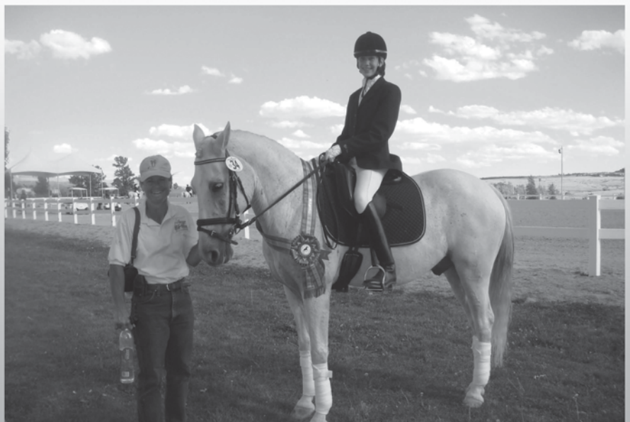
RMDS Champion & Pony of the Year 2010

Her lunge lessons out-perform any personal trainer in the business!