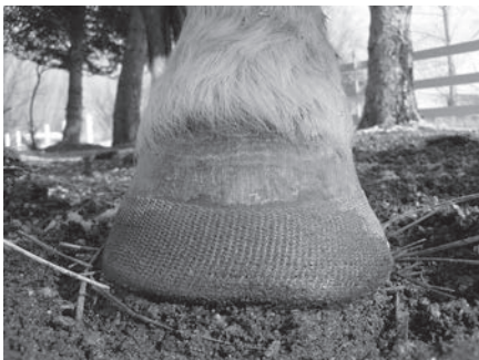
Hoof cast material can give support and enable hoof growth.

Hoof casts look much like the casting material that is used on a human with a broken arm. There are some companies that have beefed up this material to make it stronger, such as Equicast.