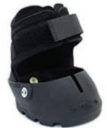
EasyCare Gloves can fit almost any horse.

The EasyBoot Glove is by far my favorite riding boot. It is very flexible, low profile and with no hard material above the hairline. With no buckles or hardware, its simplicity and performance have not been beat. It also comes in a wide array of sizes, half sizes and two widths. All of these options make it possible to fit almost any horse.