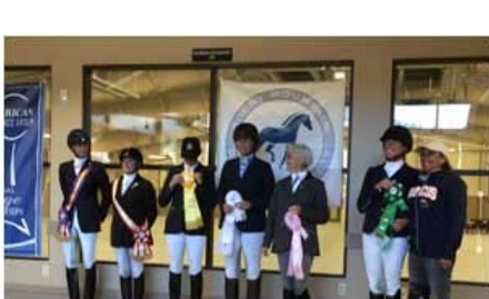
The ribbon line-up