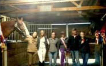
The Barn U crowd