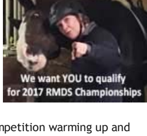
We want YOU to qualify for 2017 RMDS Championships