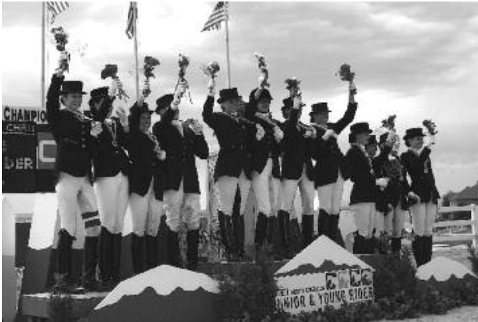
On the top podium stand, Region Five juniors show off their team gold medals.

The Region 5 Junior Team enjoyed great success at the North American Junior Young Rider Championships (NAJYRC), held July 29 thru August 3 at the Colorado Horse Park in Parker, Colo. Record-breaking temperatures in the Denver area could not cool down the Region 5 Juniors, who won gold in all three competitions, team, individual, and freestyle.